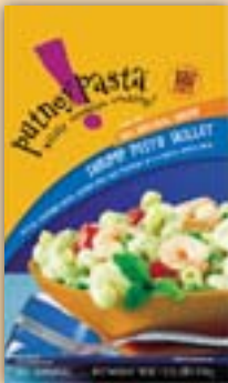
Shrimp Pesto Skillet

6/18oz 13" x 11" x 5.25" 7.65 LB 0.434 12x10=120