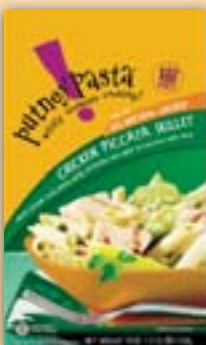
Chicken Piccata Skillet

6/18oz 13" x 11" x 5.25" 7.65 LB 0.434 12x10=120