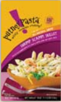
Shrimp Scampi Skillet

6/18oz 13" x 11" x 5.25" 7.65 LB 0.434 12x10=120