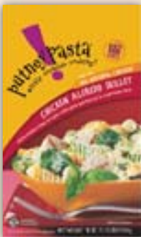
Chicken Alfredo Skillet

6/18oz 13" x 11" x 5.25" 7.65 LB 0.434 12x10=120